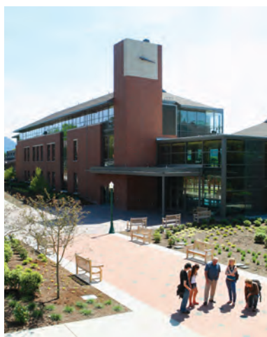
To see a slideshow of the new building, go to giving.uoregon.edu/coe.htm .